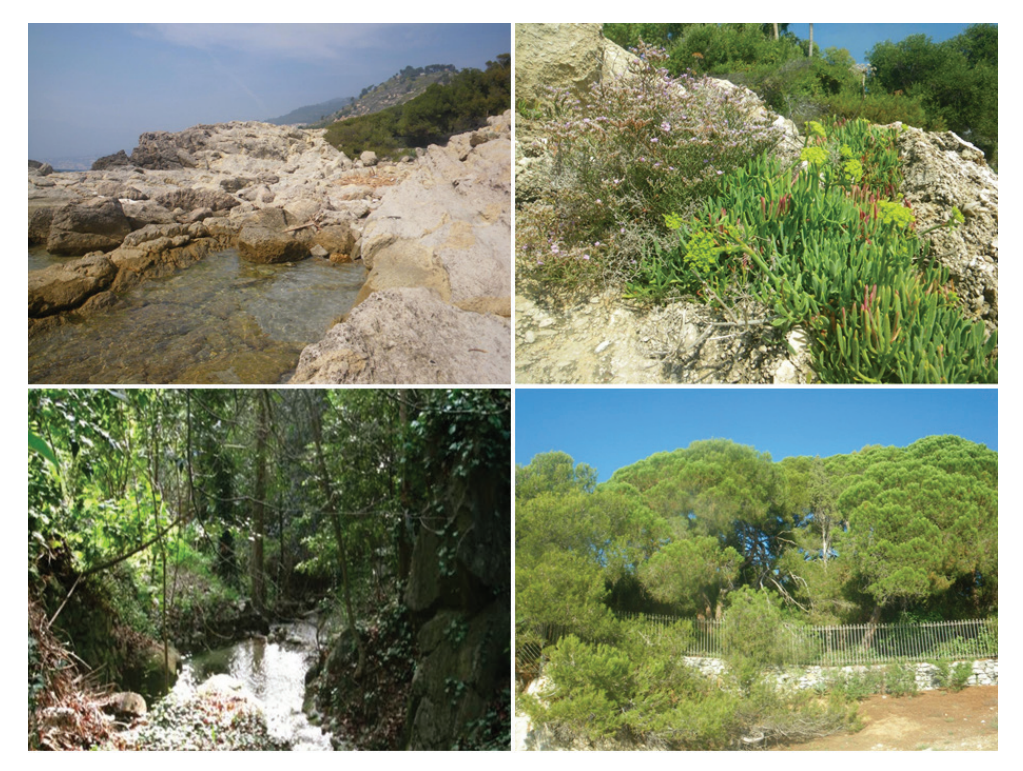
Figure 3. Examples of the natural and semi-natural habitats of the study area. Above: cliff and scrub; below: riparian forest and pine forest.

The GBH were created starting from 1867 by the supervision of its founder Sir Thomas Hanbury (1832–1907), who bought the building and the surrounding areas with the goal to acclimate species of rare plants and plants with high pharmacological interest coming from warm-temperate regions all over the world. He was supported by his brother Daniel Hanbury (1825–1875), pharmacologist and botanist, and by Ludwig Winter (1846–1912), a German botanist and landscape architect. Scientific activities began in 1880. The GBH, the regional protected area and the SAC Capo Mortola are currently managed by Università degli Studi di Genova. The progression and changes in